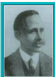
First Honorary Secretary

Sir Thomas Henry Holland joined GSI in 1890 and became its Director after superseding several senior officers on 25th February 1903. He was only 34 years old. Besides, being instrumental in laying the foundation of Mining and Geological Institute he was responsible for organising the "Geology Department" of Presidency College and "Geology Section" on Indian Museum. He retired in 1909 at the age of 41 to accept Professorship of Geology at Manchester University. He came back to India later as Chairman, Indian Industrial Commission in 1916; became a member of Viceroy's Executive Council in-charge of "Industries and Commerce" in 1919-21. On his return to England he was Rector of Imperial College, Vice Chancellor, Edinburg University, Vice President Royal Society and many other learned societies. His interest in progress of geological research in our country remained till death on 15th May, 1947.