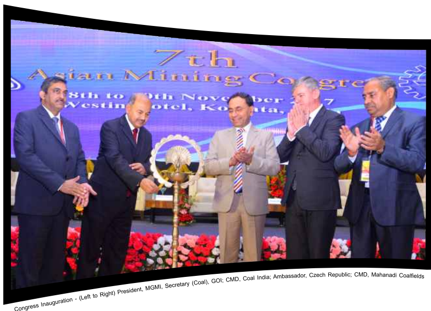
Congress Inauguration - (Left to Right) President, MGMI, Secretary (Coal), GOI, CMD, Coal India; Ambassador, Czech Republic; CMD, Mahanadi Coalfields