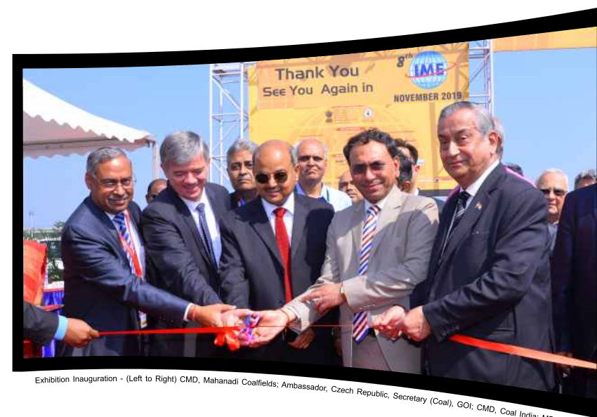
Exhibition Inauguration - (Left to Right) CMD, Mahanadi Coalfields; Ambassador, Czech Republic, Secretary (Coal), GOI, CMD, Coal India; MD, Tefcon